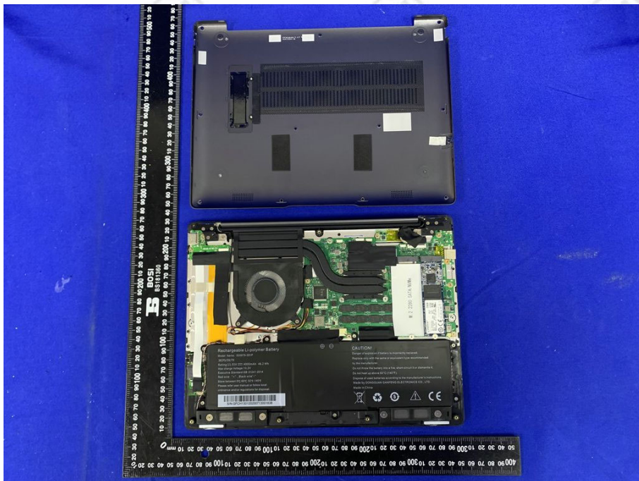
View of Product-10