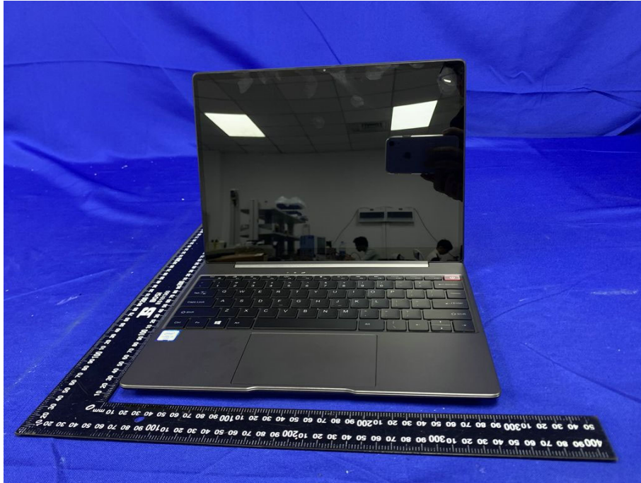
View of Product-9