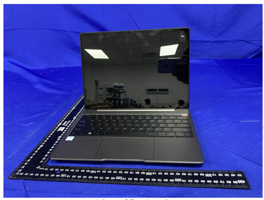
View of Product-9