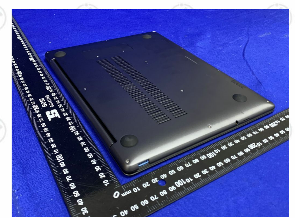
View of Product-4