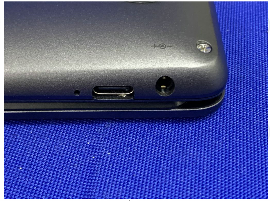
View of Product-5