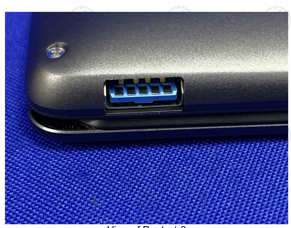
View of Product-6