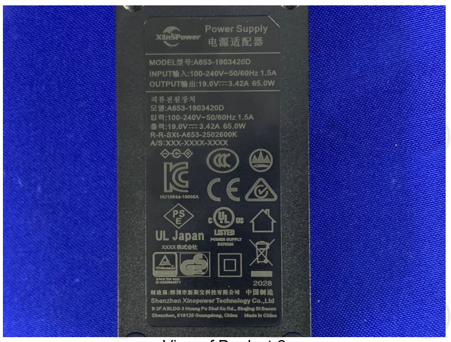
View of Product-2