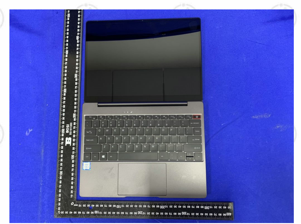
View of Product-8