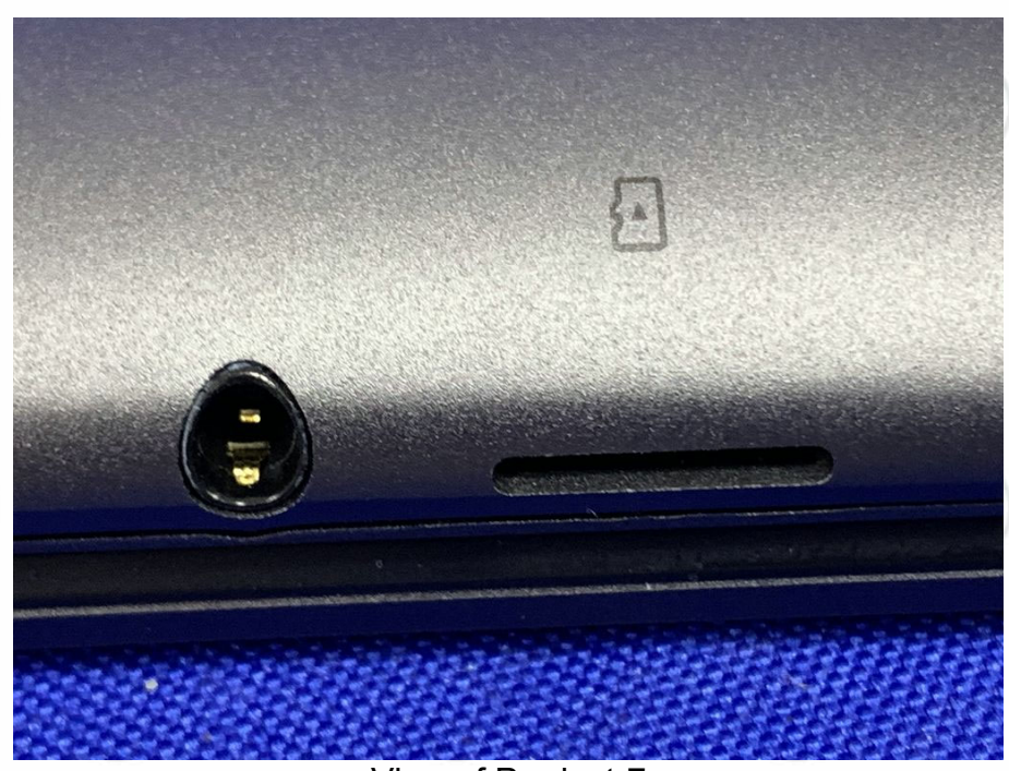
View of Product-7