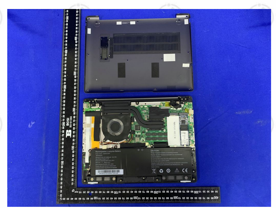
View of Product-10