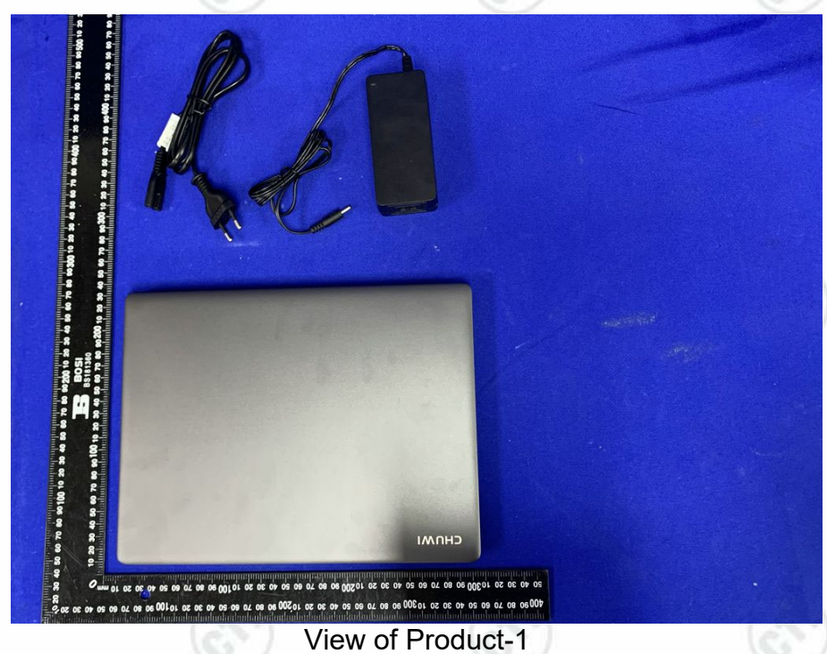
View of Product-1