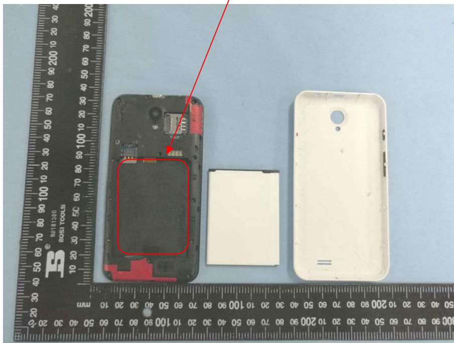
FCC ID Label Location