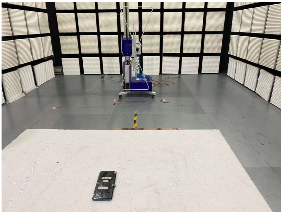
Field Strength of Spurious Radiation (30MHz - 1GHz)