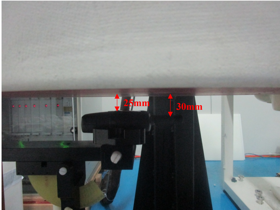
Body Worn Back Setup Photo (0mm)