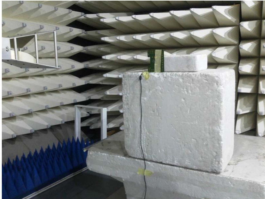
Photograph No.1 Carrier field strength and OBW measurement setup