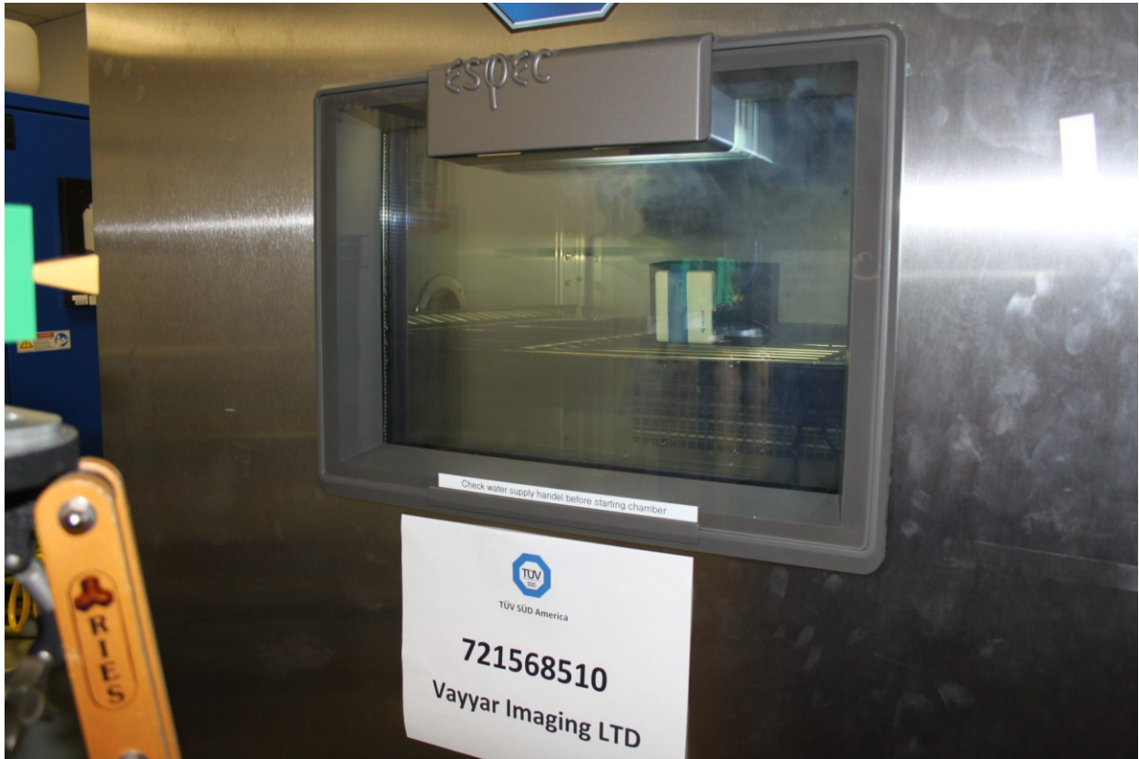
Frequency Stability Test Setup