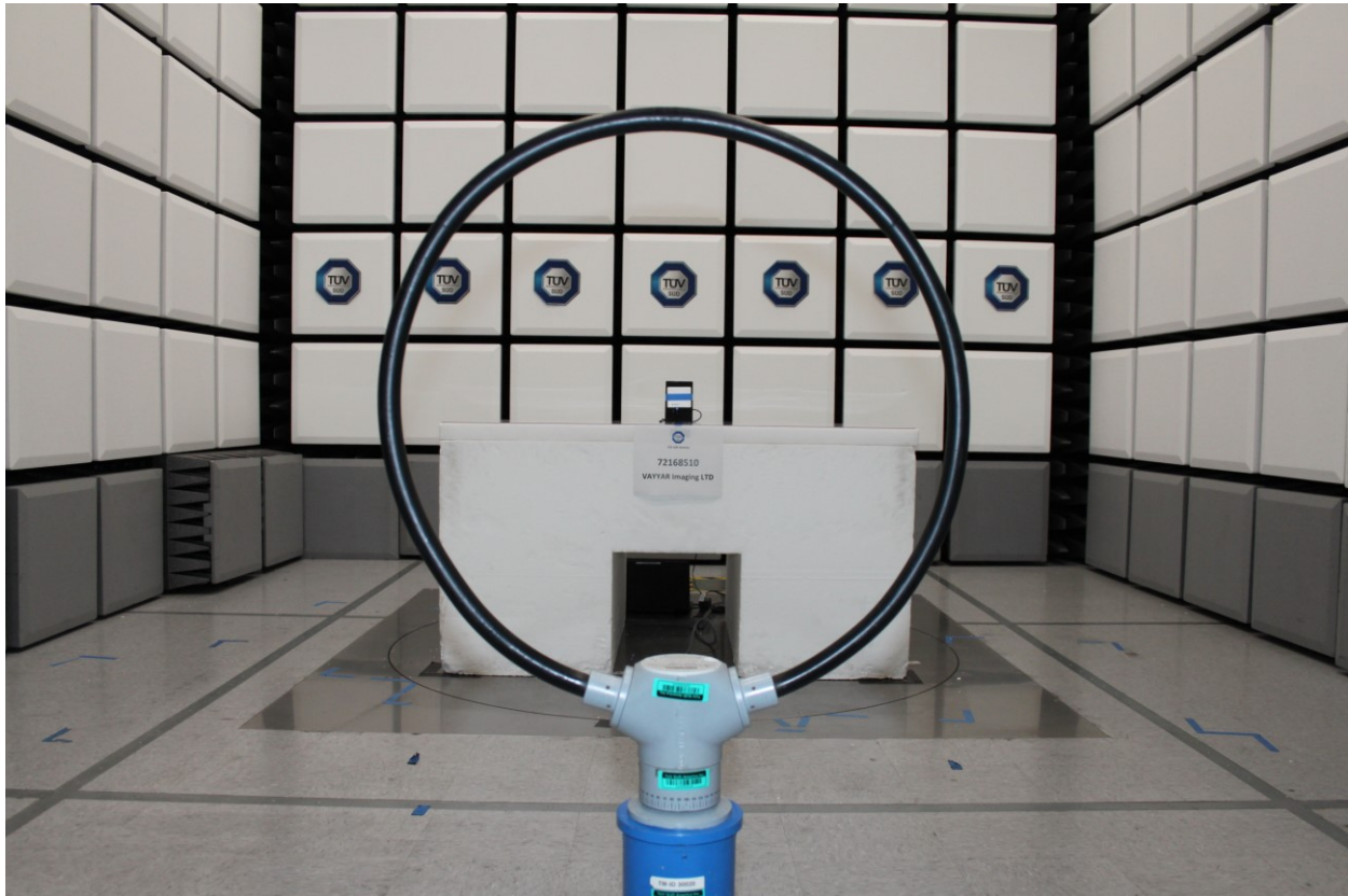
Radiated Emissions Test Setup (below 30MHz)

*Margin observed at this range is >40dB, the use of an alternative Test Site is justified.