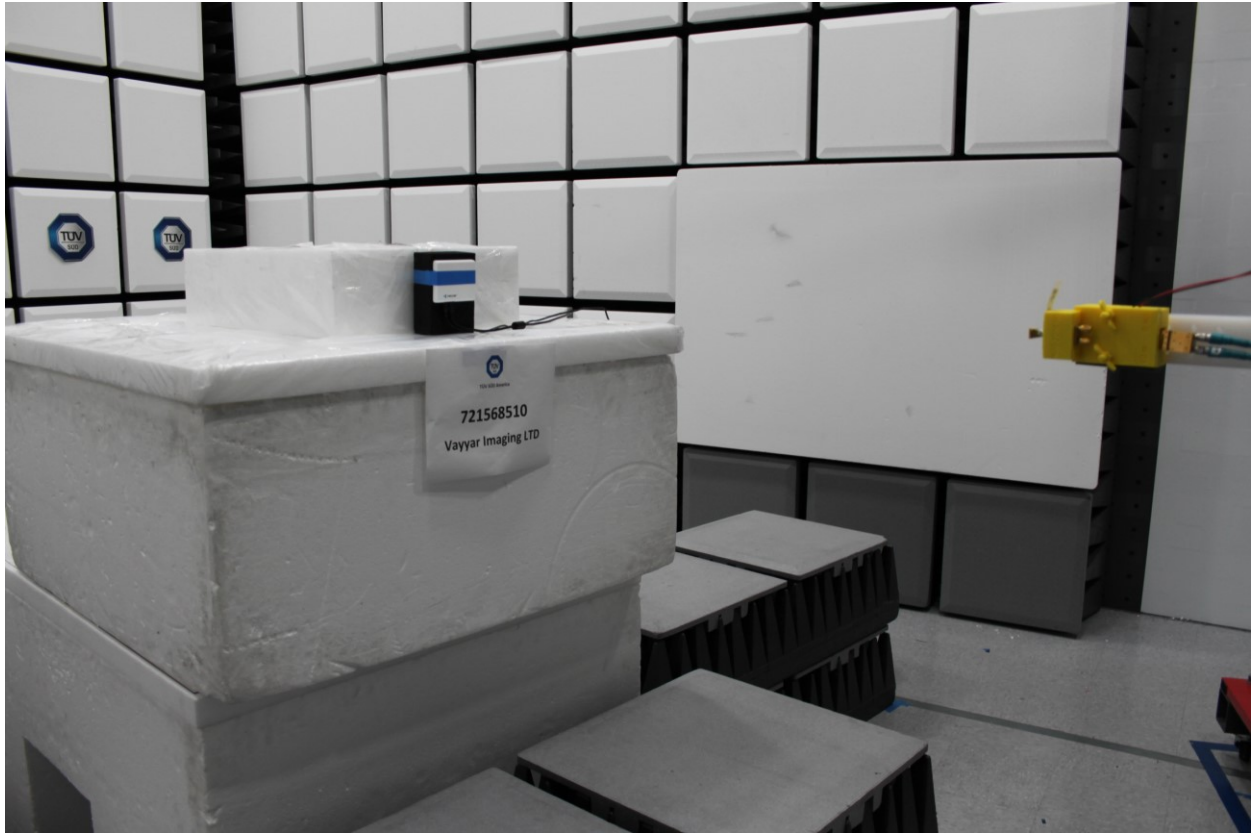
Radiated Emissions Test Setup (75GHz to 140GHz)