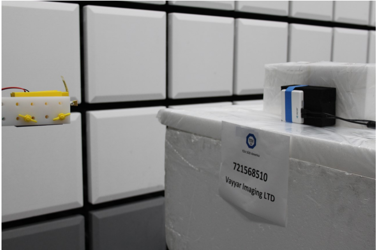
Radiated Emissions Test Setup (140GHz TO 200GHz)