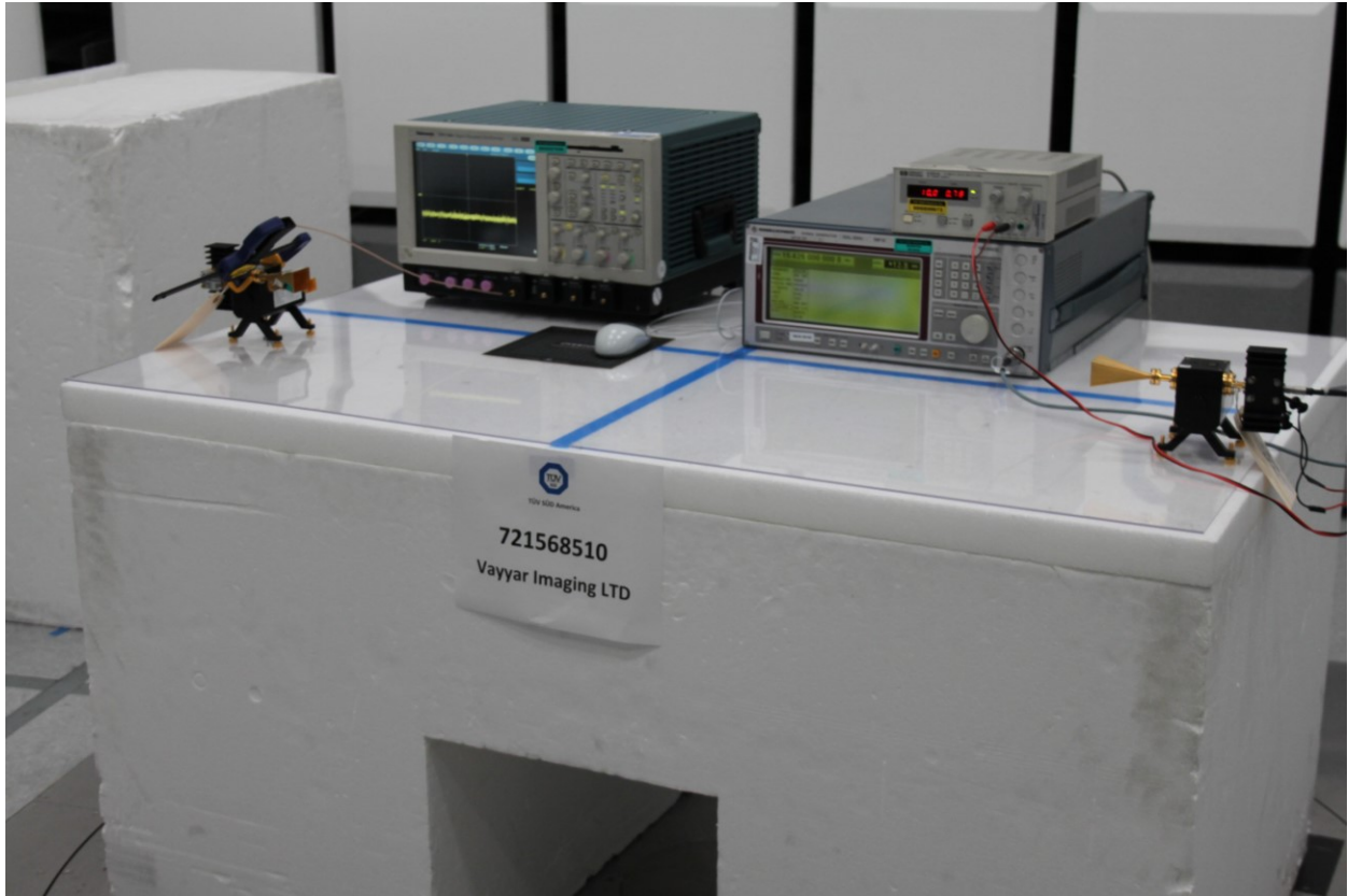
Power Measurement/Substitution Test Setup