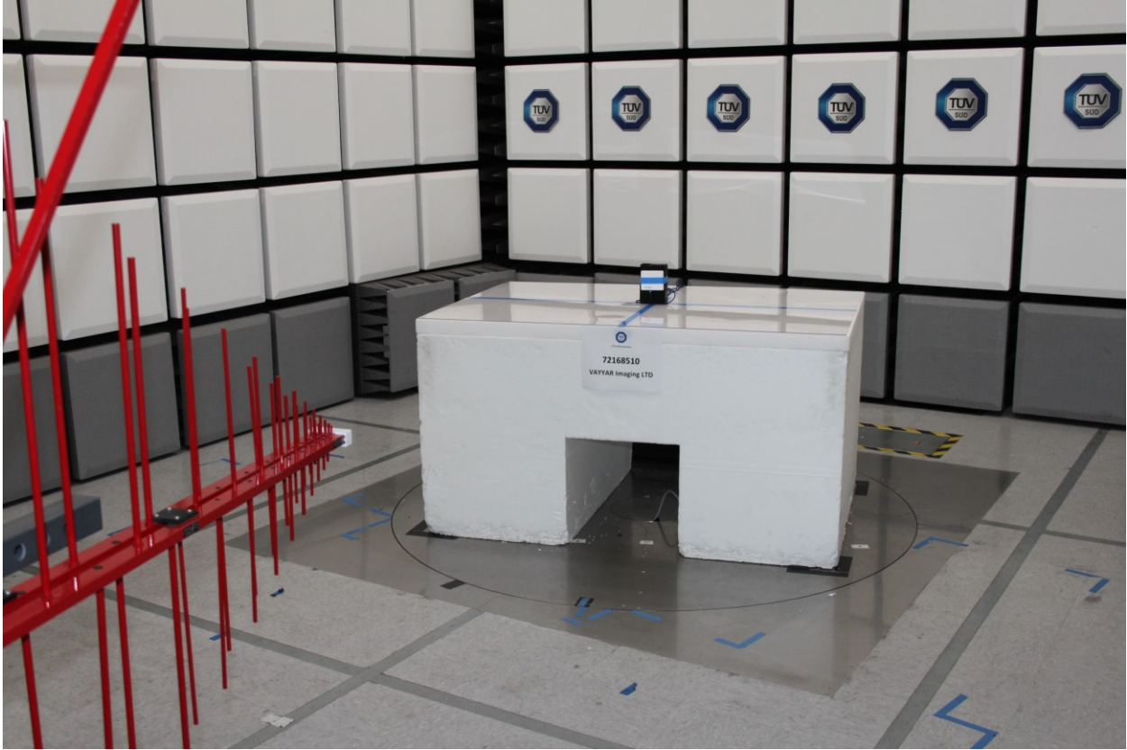
Radiated Emissions Test Setup (30MHz to 1GHz)