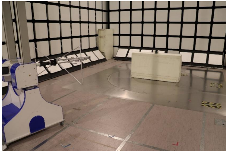
Photograph 4. Radiated Emissions 30 – 1000 MHz