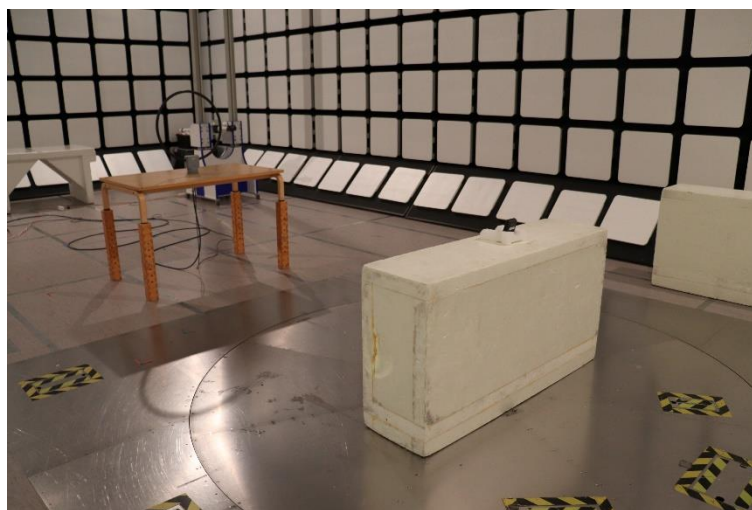
Photograph 3. Radiated Emissions 0.009 – 30 MHz