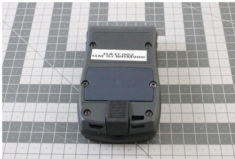
Photograph 2. The EUT