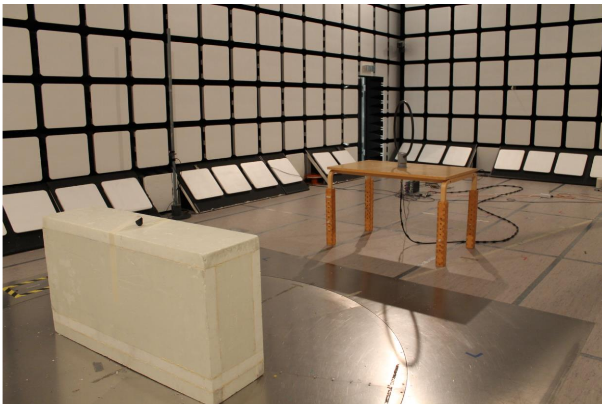
Photograph 3. Radiated emission setup below 30 MHz.