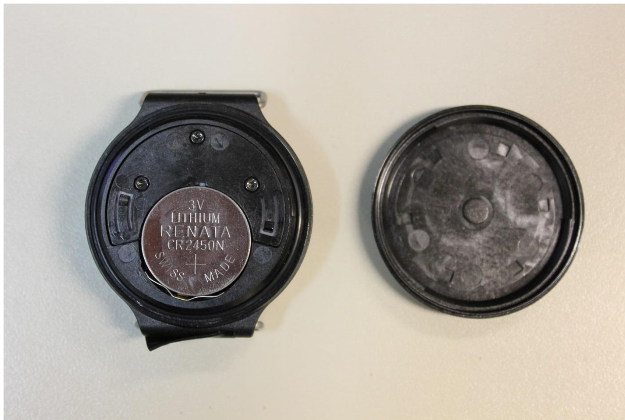
Photograph 2. The EUT (Rear side).