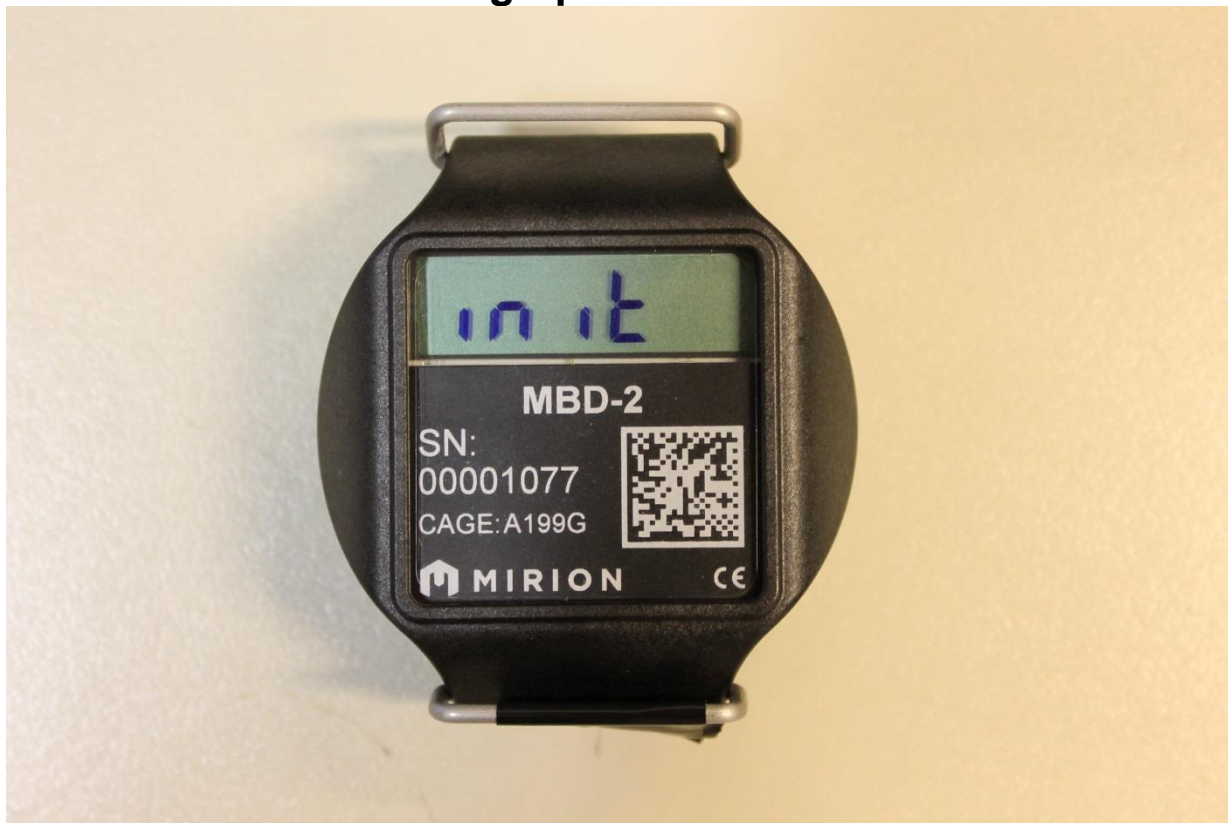
Photograph 1. The EUT (front side).