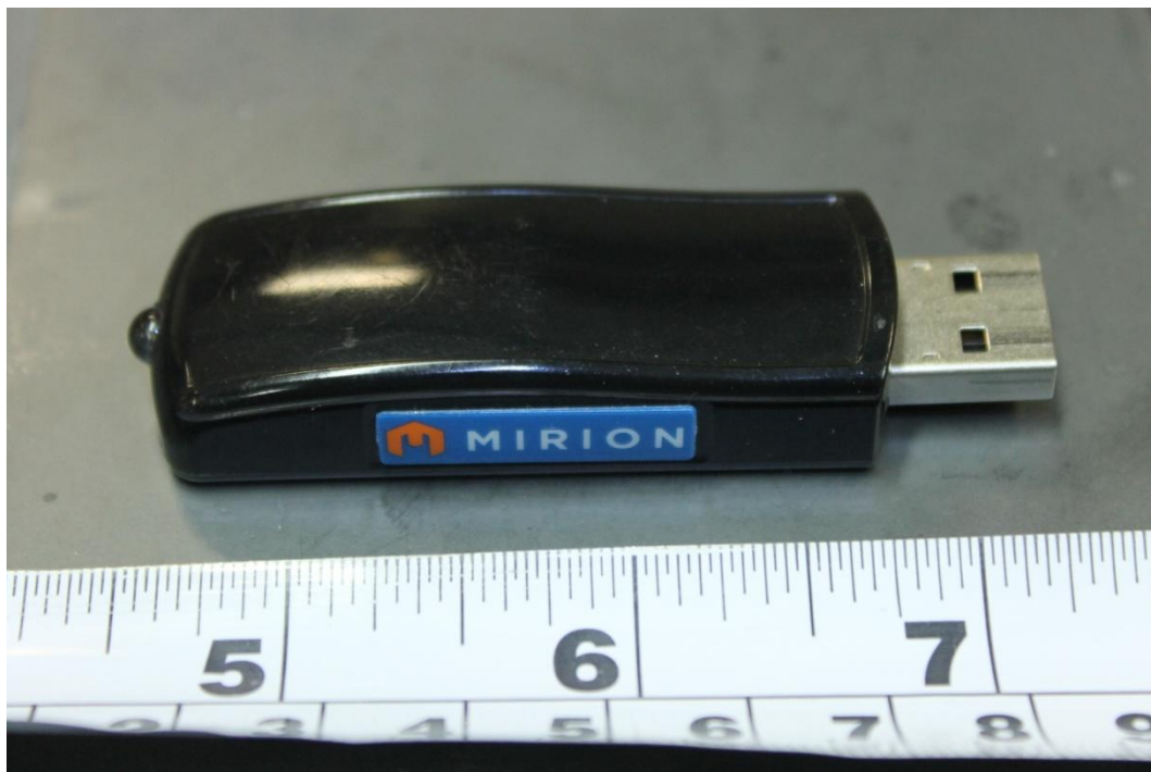
Photograph 1. The EUT.