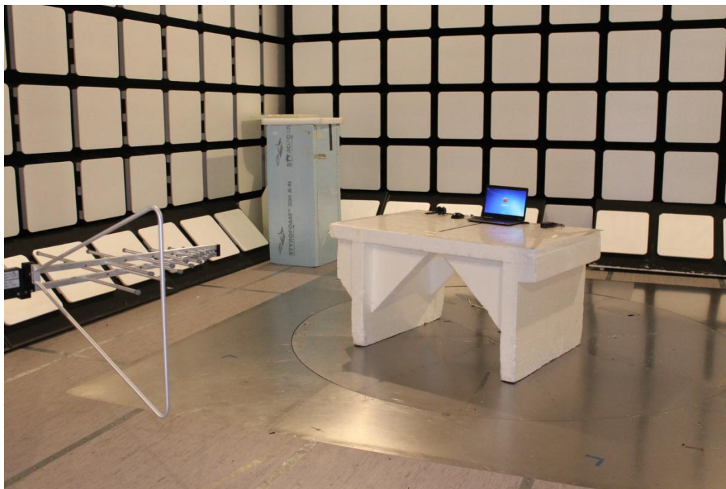
Photograph 2. Radiated emission 30 to 1000 MHz.