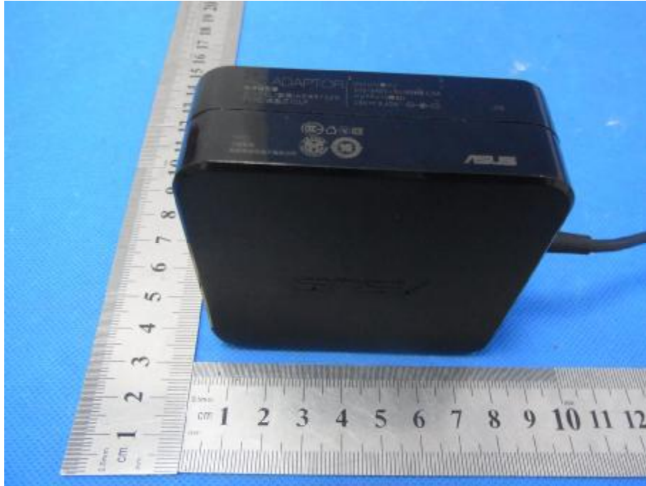
Lab provides adapter