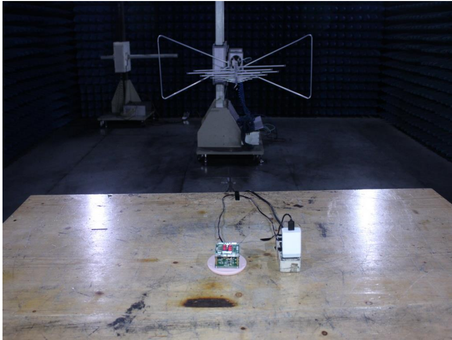
Photograph 4: Set-up for RF Exposure