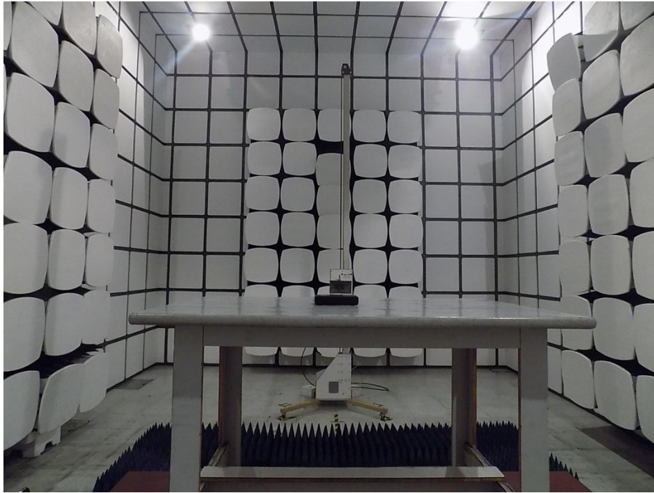
Photos of Conducted Emission test