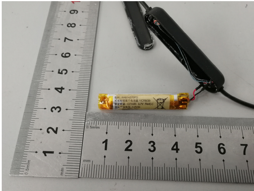
EUT – Cover off View -2