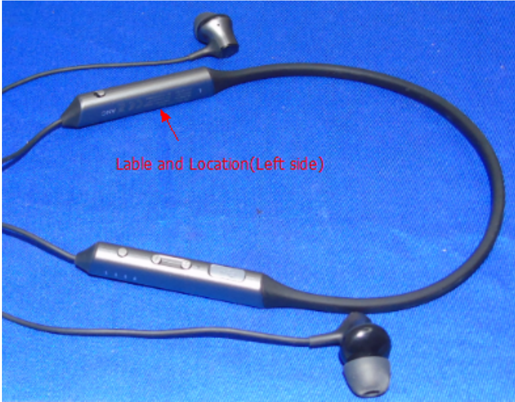
Lable and Location(Left side)