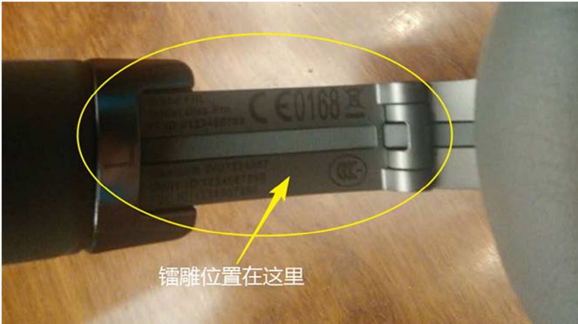
The label stamped to the equipment by permanent adhesive