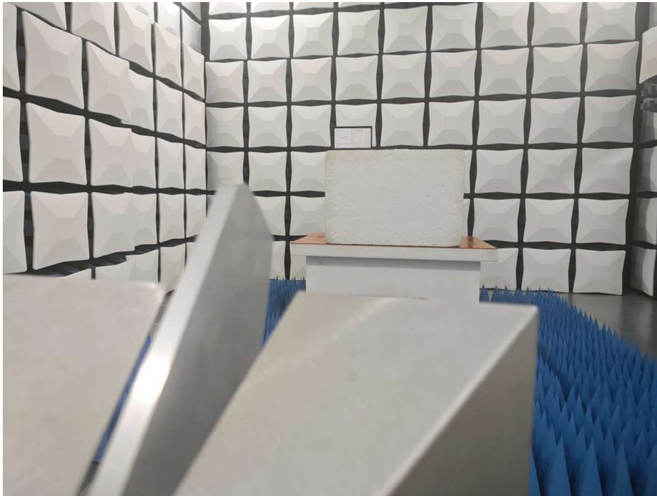
Test Set-up: Radiated spurious emission Above 1GHz