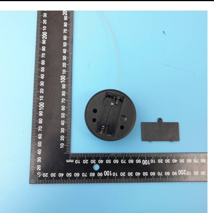
EXHIBIT C - EUT INTERNAL PHOTOGRAPHS