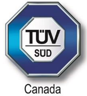
Exhibit: Label Location