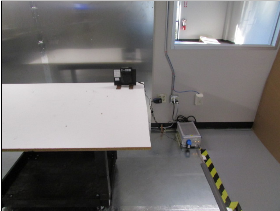
Figure 3: Power Line Conducted Emissions Test Set Up – Front View