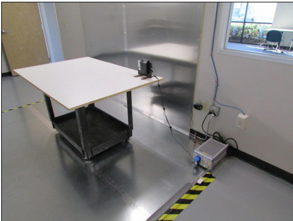
Figure 4: Power Line Conducted Emissions Test Set Up – Side View