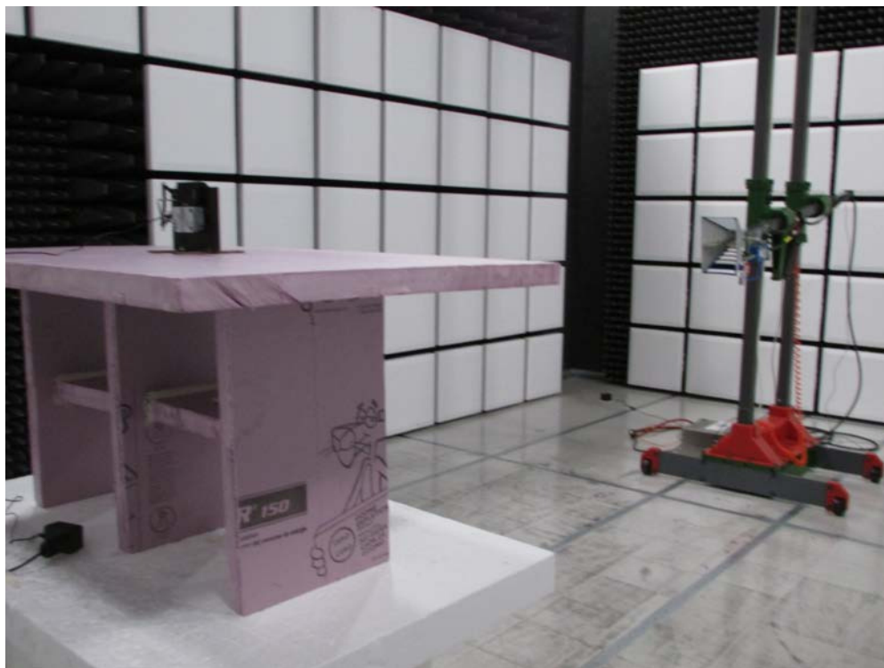
Figure 2: Radiated Emissions Test Set Up – Rear View