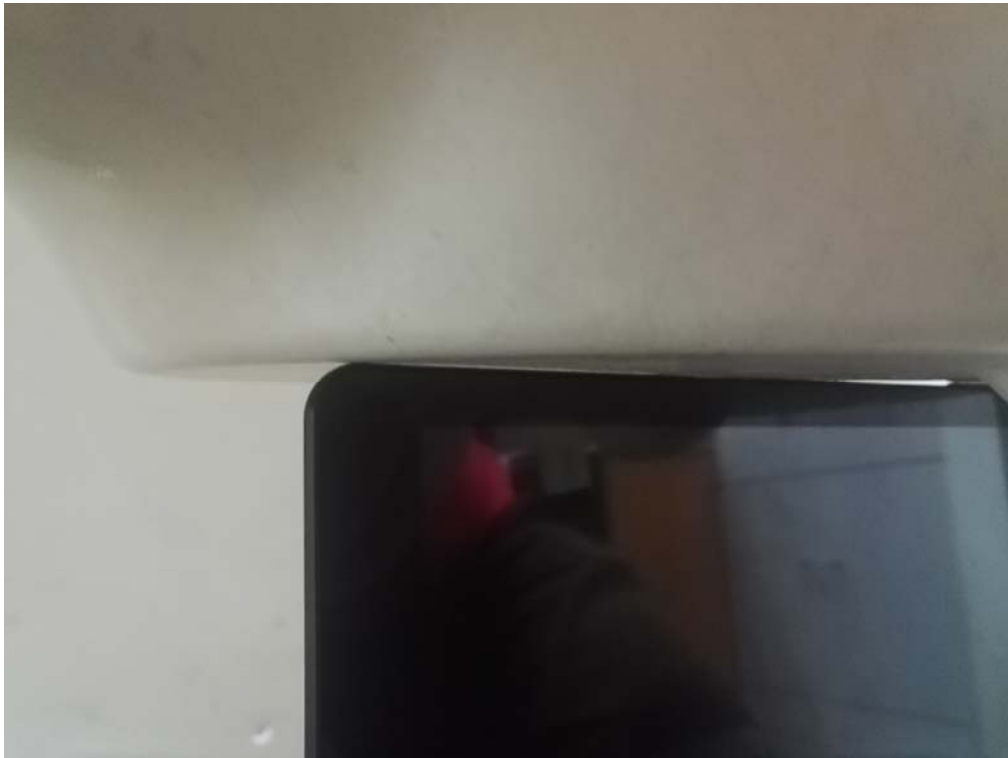
Body-worn Bottom Setup Photo (0mm)