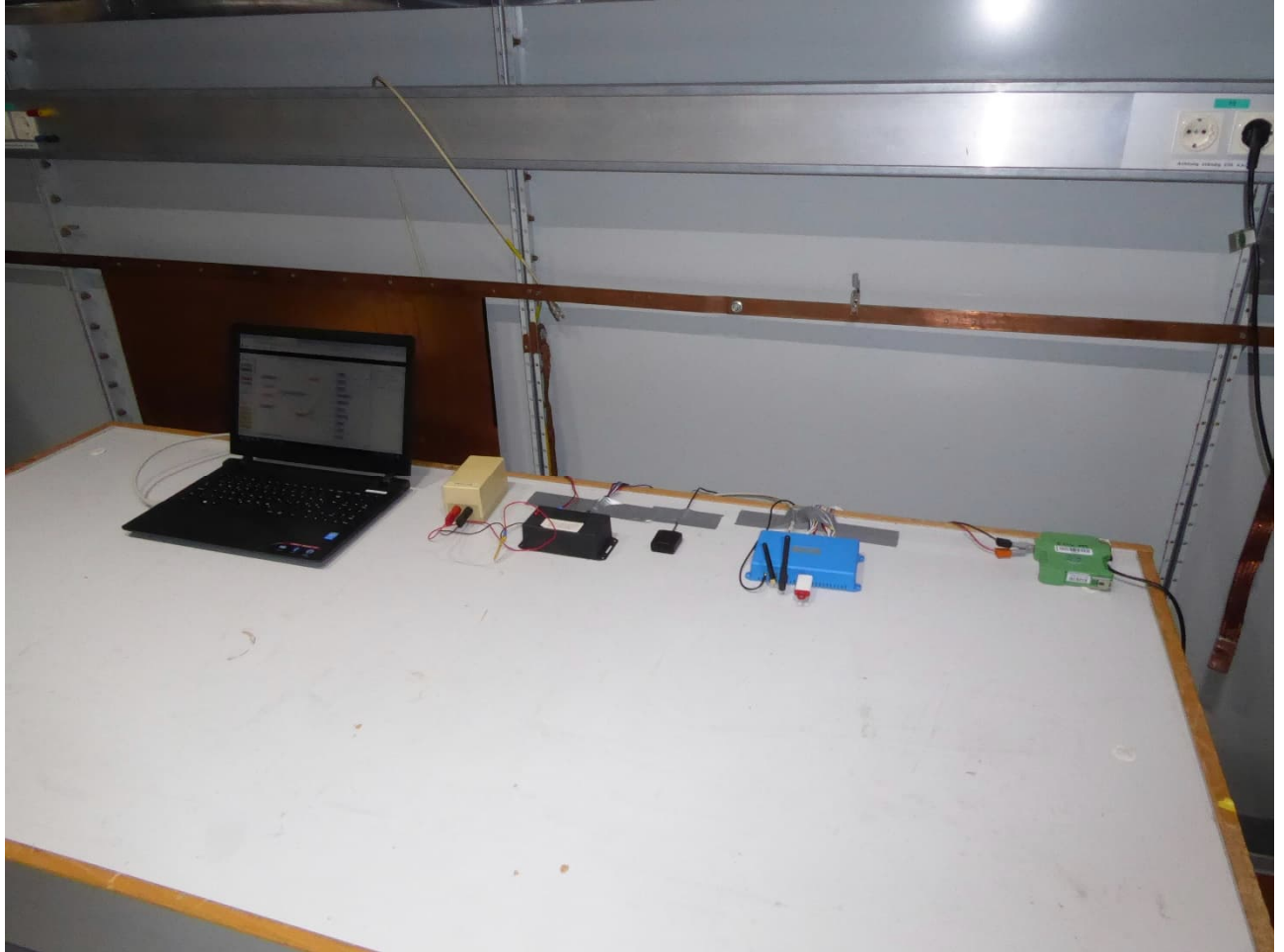
Test setup shielded room M4