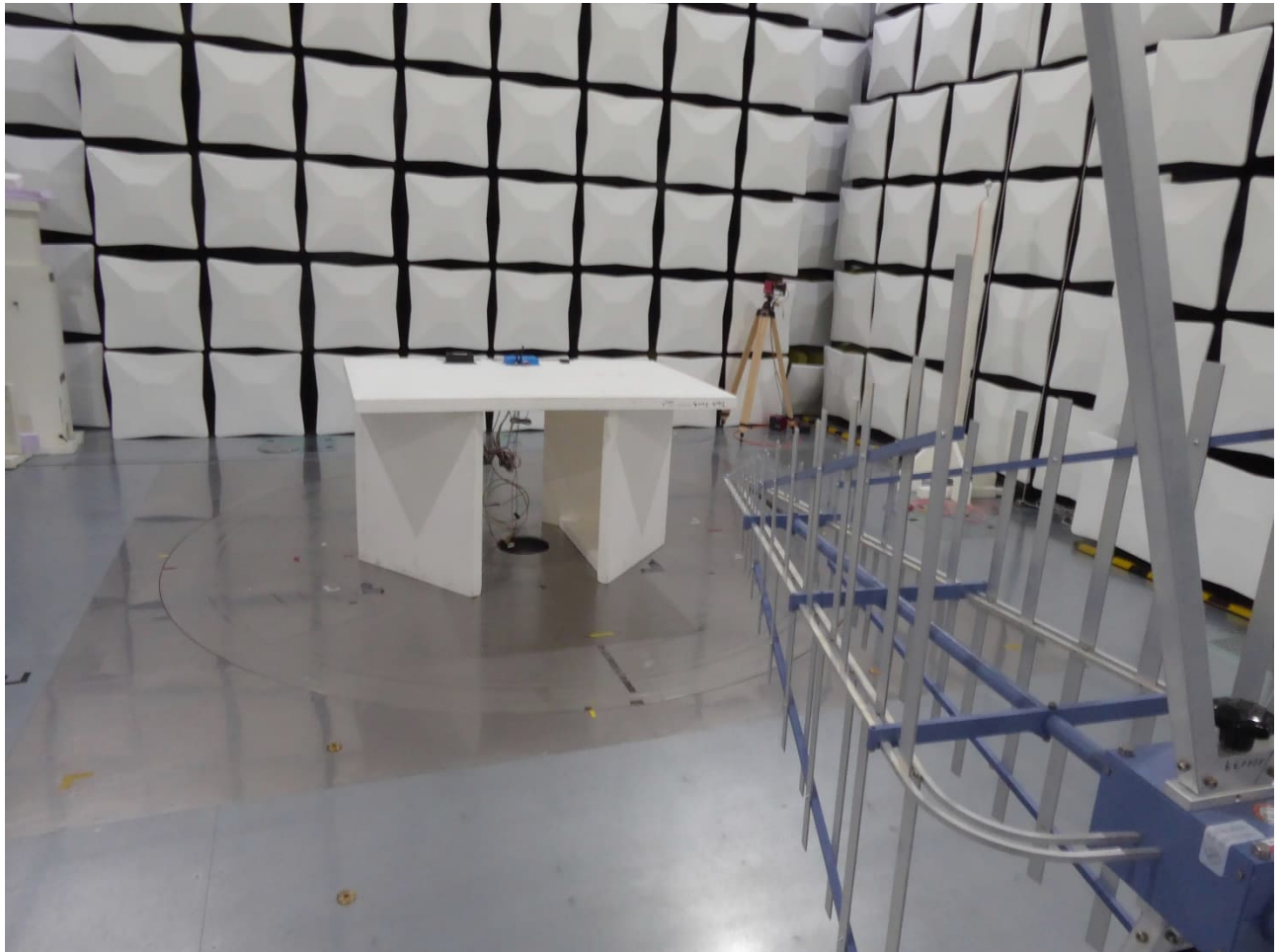
Test setup semi anechoic chamber M276, 30 MHz – 1 GHz