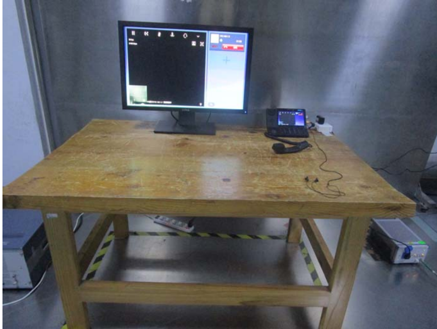
Conducted Emissions – Side View(Adapter)