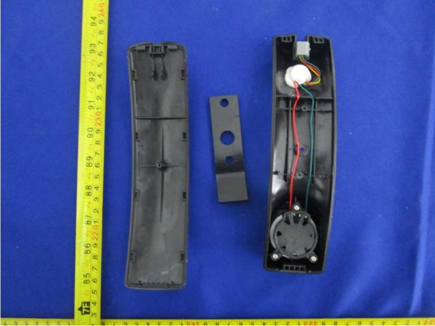
EUT – Phone Speaker Top View