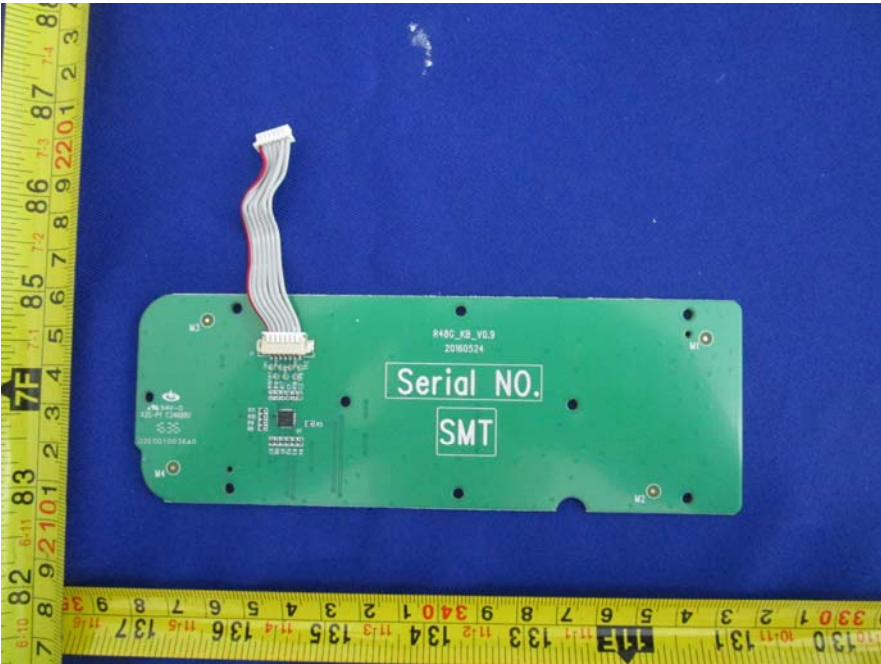
EUT – Panel Top View