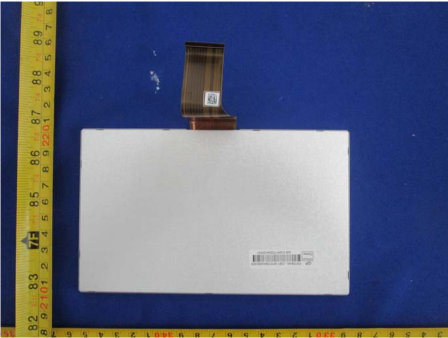
EUT – Panel Label View