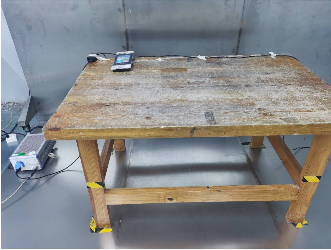
Conducted Emissions Side View -Powered by POE