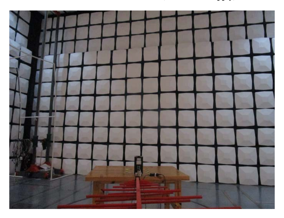
Radiated Emission- Rear View (PoE Power Supply)