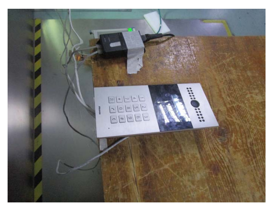
Conducted Emissions – Side View(PoE Adapter supply)

Conducted Emissions – Front View(PoE Adapter supply)