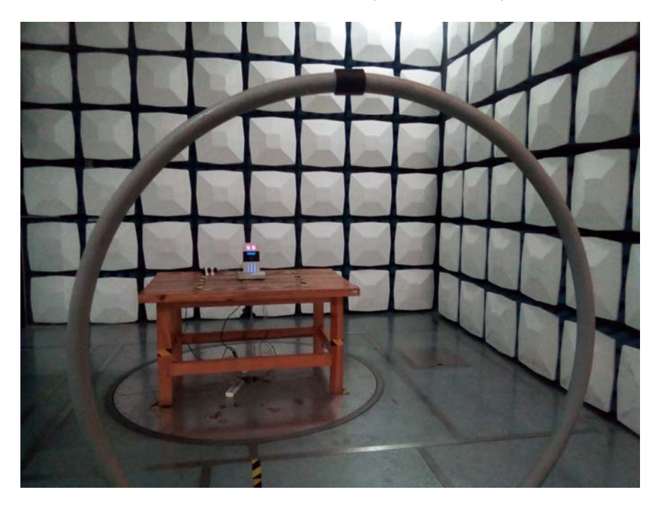
Radiated Emission- View(9 kHz-30 MHz)