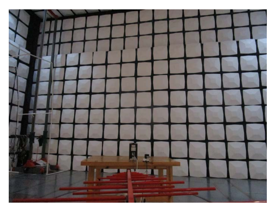
Radiated Emission- Rear View (Adapter Power Supply)