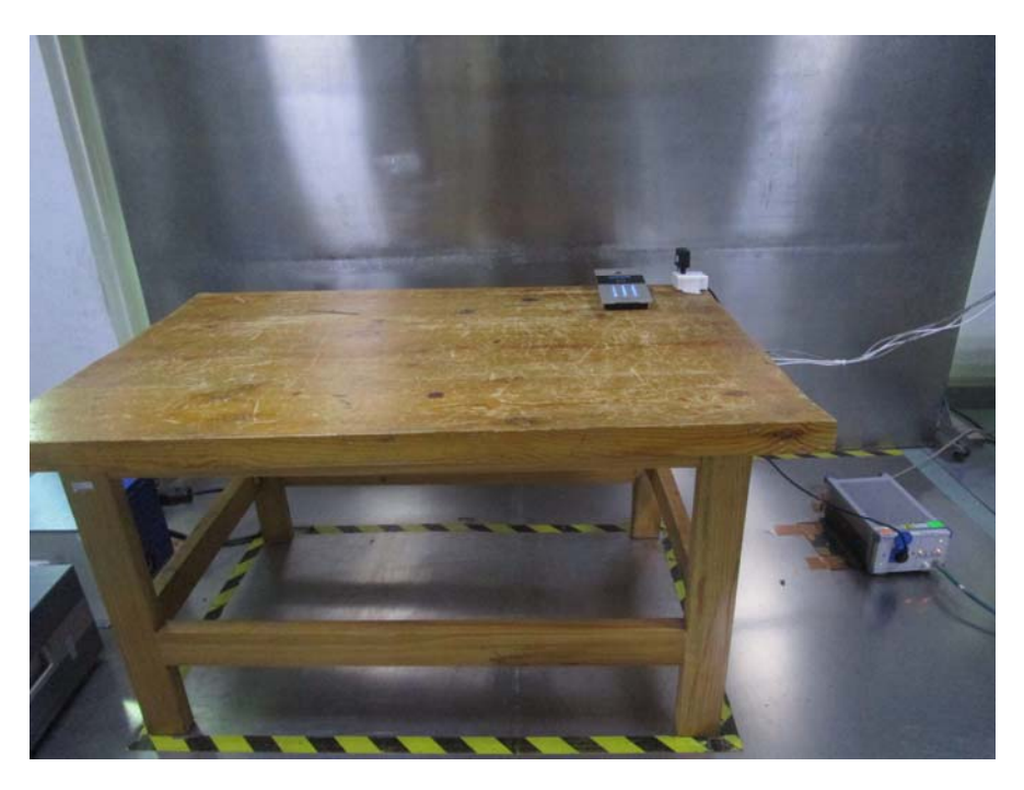
Conducted Emissions – Side View(Adapter Power Supply)

Conducted Emissions – Front View(Adapter Power Supply)