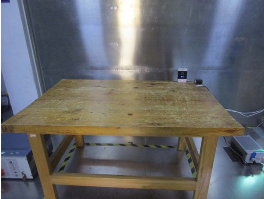
Conducted Emissions –PoE- Side View