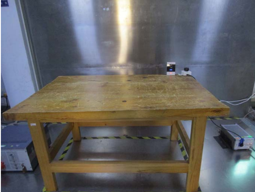
Conducted Emissions –Adapter Supply- Side View