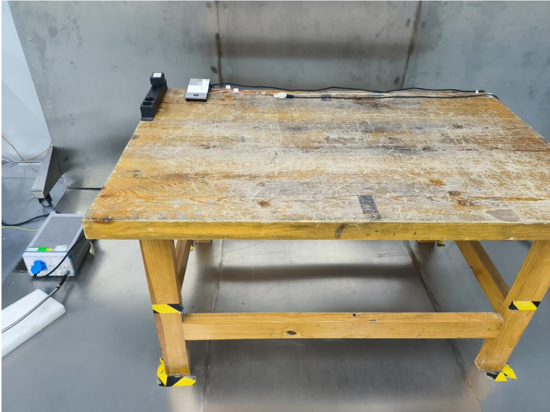
Conducted Emissions Side View –Adapter mode