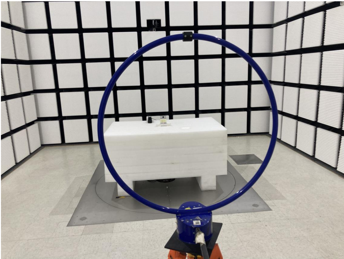
Radiated Emission 9kHz-30MHz Perpendicular View –Adapter mode