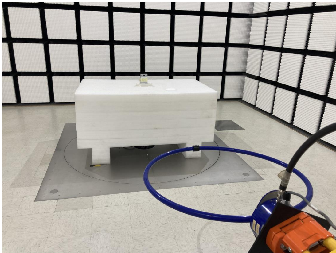
Radiated Emission 30MHz-1GHz View –POE mode