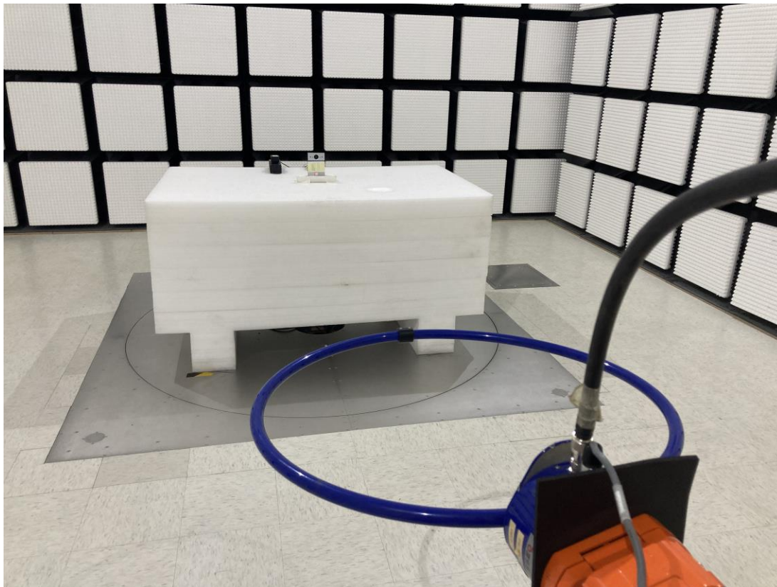
Radiated Emission 30MHz-1GHz View –Adapter mode