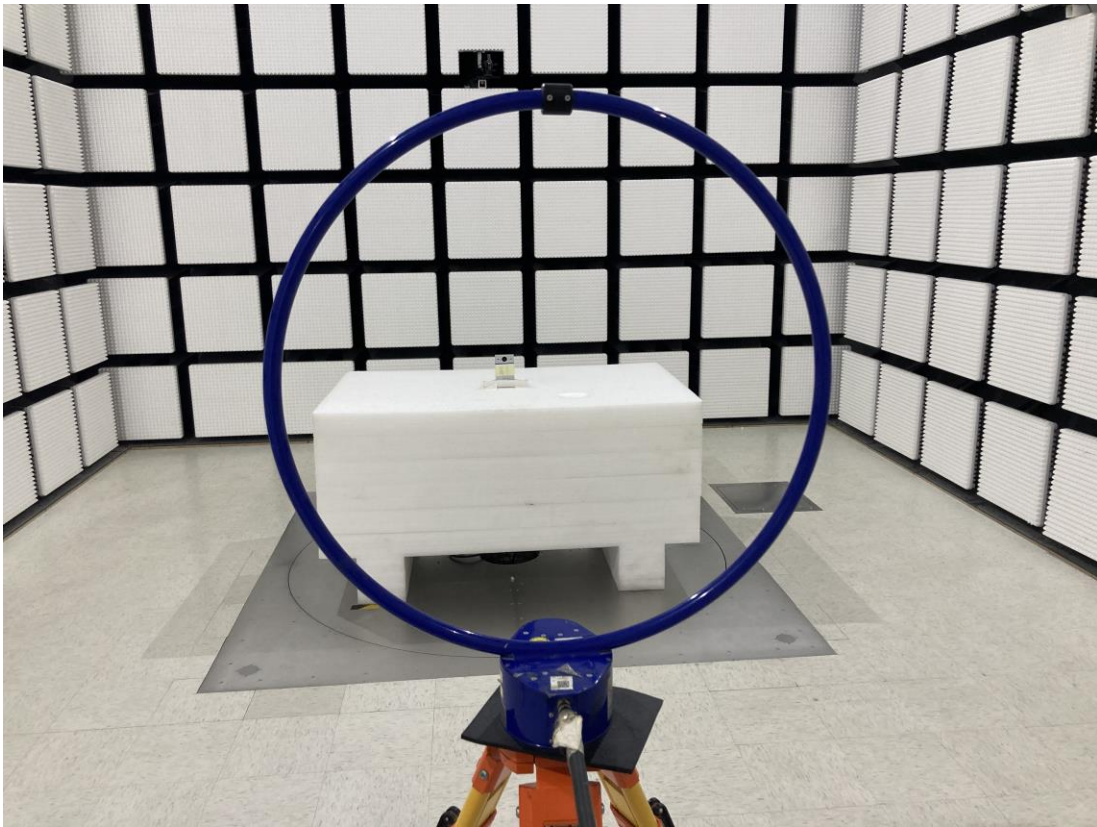
Radiated Emission 9kHz-30MHz Perpendicular View –POE mode