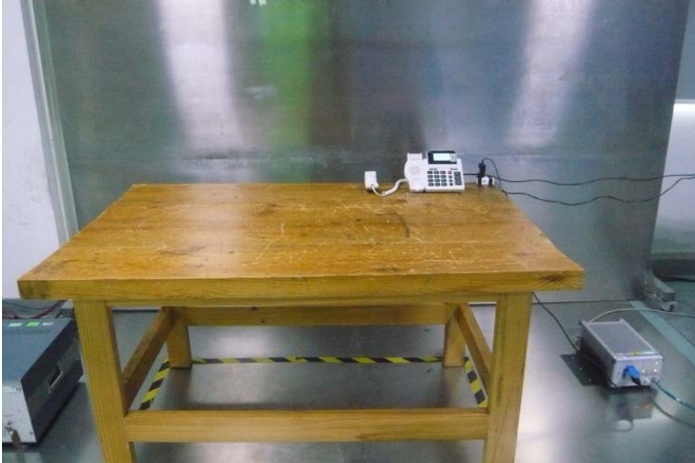
Conducted Emissions - Side View (Adapter)