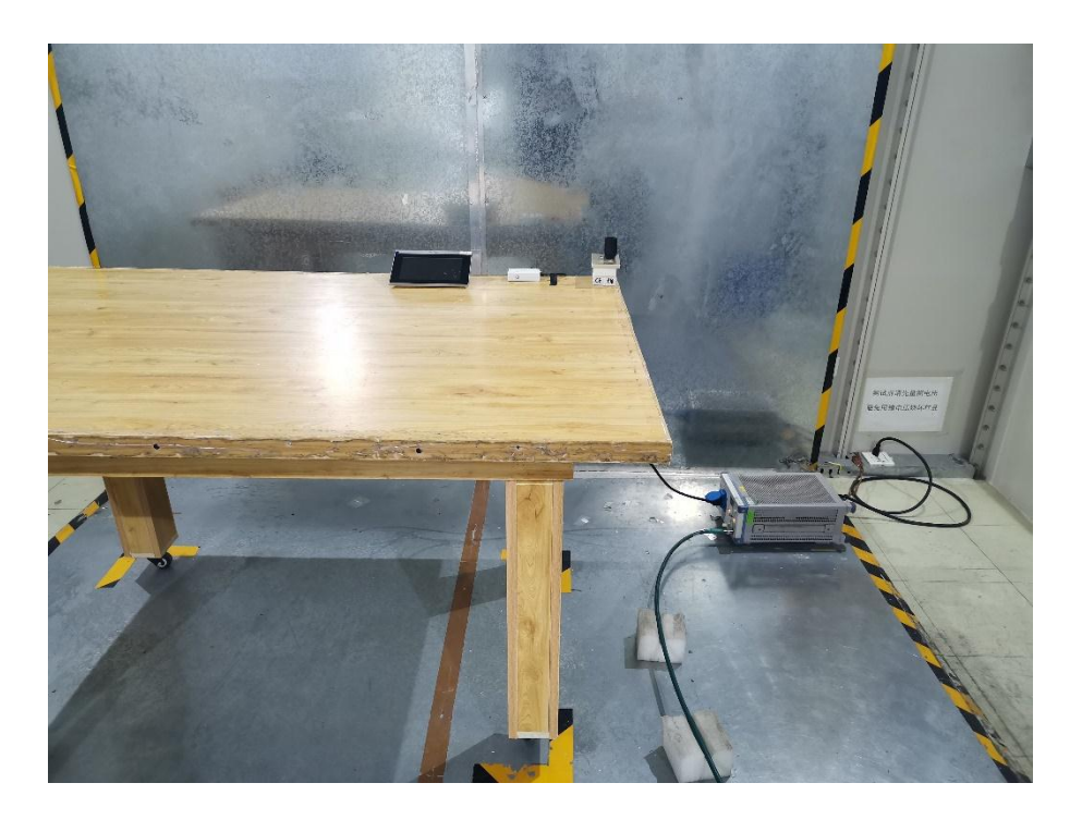
Conducted Emissions (Side View)