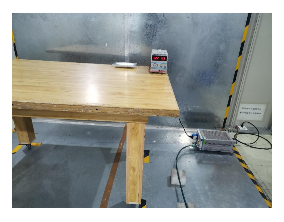
Conducted Emissions (Side View)