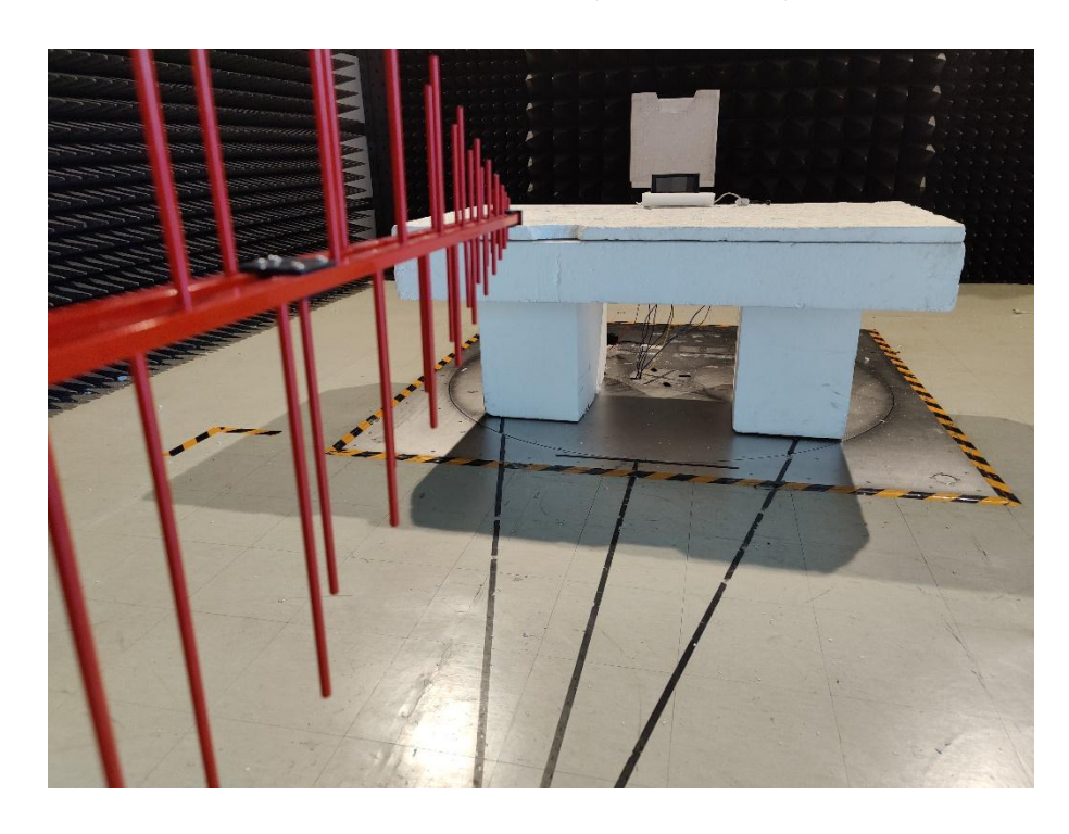
Radiated Emissions (Above 1GHz)