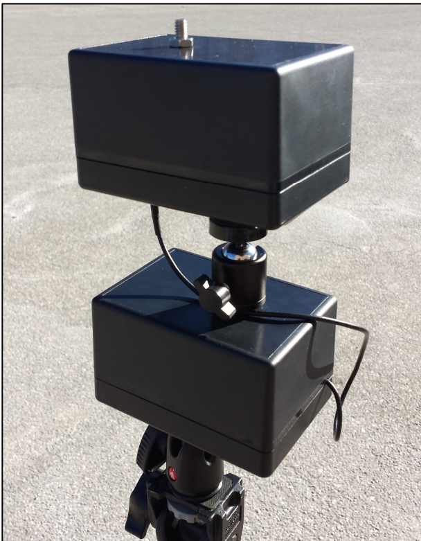
Mounted Reference Node Housing