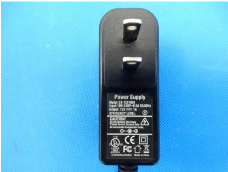
Lab provides adapter