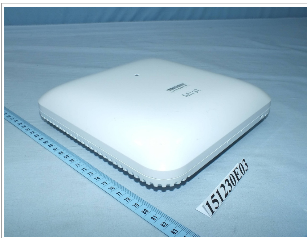
EUT with internal antenna