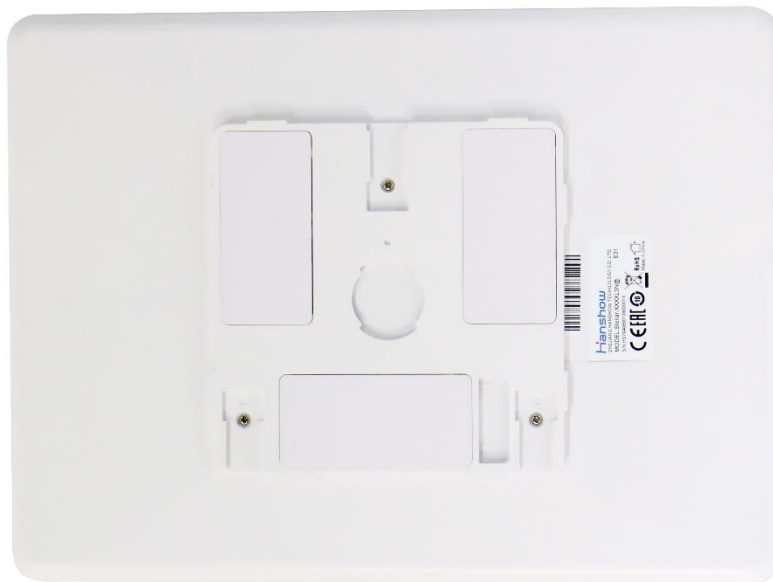
Figure 2-2 Rear panel of Stellar-XXXXL E31

The rear area of Stellar-XXXXL is shown in Figure 2-2 .