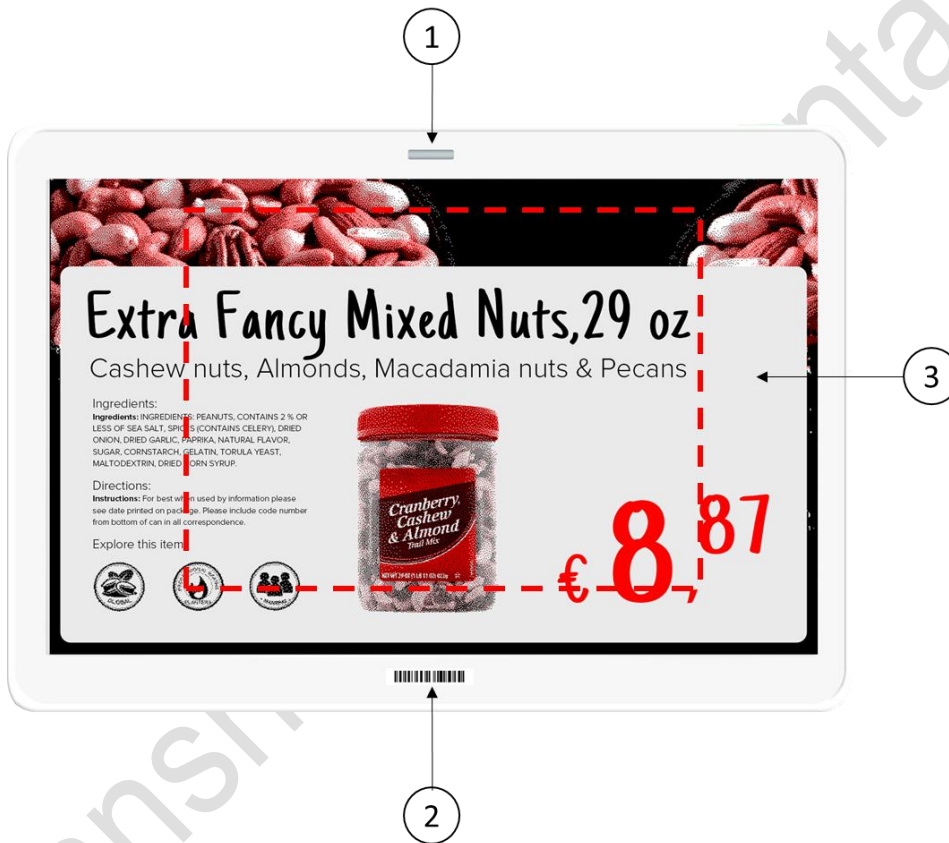
Figure 2-1 Front area of Stellar-XXXXL E31

The front area of Stellar-XXXXL is shown in Figure 2-1 , and the function of each area is shown in Table 2-2 .