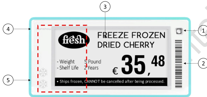
Figure 2-1 Front area of Stellar-XMF E31

The front area of Stellar-XMF is shown in Figure 2-1 , and the function of each area is shown in Table 2-2 .