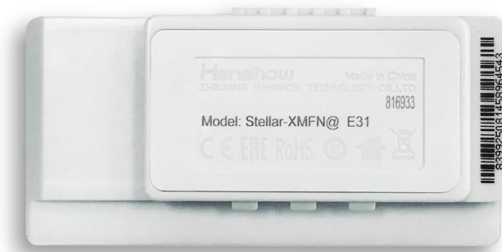
Figure 2-2 Rear panel of Stellar-XMF E31