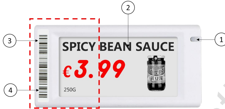
Figure 2-1 Front area of Nowa-213

The front area of Nowa-213 is shown in Figure 2-1 , and the function of each area is shown in Table 2-2 .