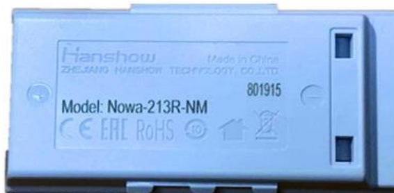
Figure 2-2 Rear panel of Nowa-213

The rear area of Nowa-213 is shown in Figure 2-2 .