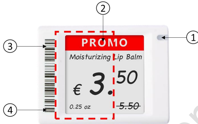
Figure 2-1 Front area of Nowa-154

The front area of Nowa-154 is shown in Figure 2-1 , and the function of each area is shown in Table 2-2 .