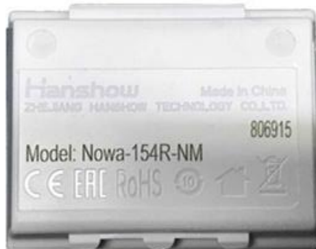
Figure 2-2 Rear panel of Nowa-154

The rear area of Nowa-154 is shown in Figure 2-2 .