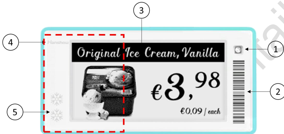
Figure 2-1 Front area of Stellar-MF E31

The front area of Stellar-MF is shown in Figure 2-1 , and the function of each area is shown in Table 2-2 .