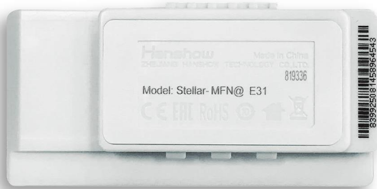
Figure 2-2 Rear panel of Stellar-MF E31