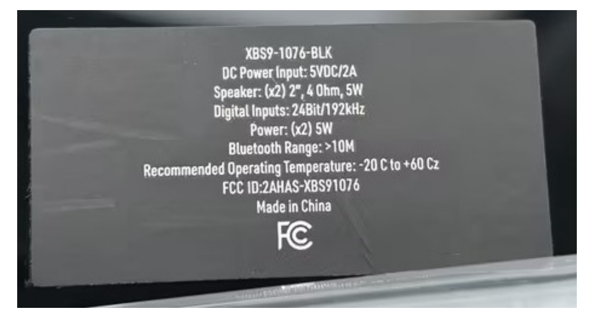
FCC ID Label Location Information