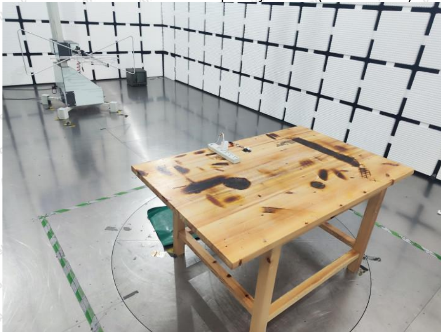
Emissions in restricted frequency bands (above 1GHz)