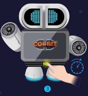
Wake Corbit up and start your adventure