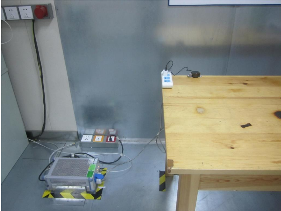
DSS&DTS radiation L