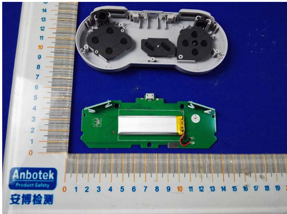
The EUT-Inside View