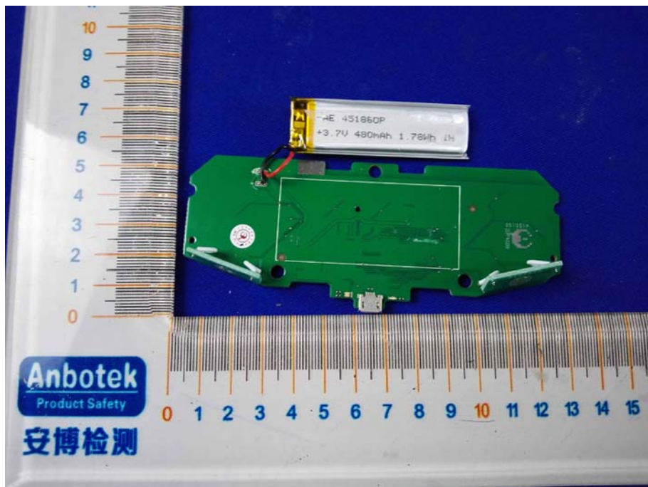
PCB of the EUT-Back View