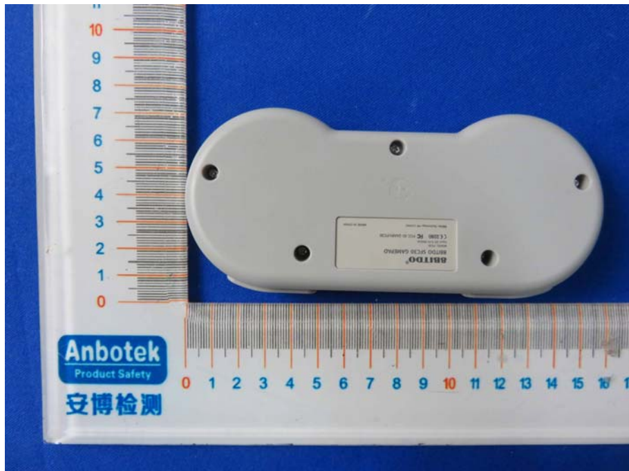
The EUT- Bottom View (Model No.: SFC30)