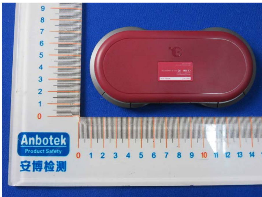
The EUT- Bottom View (Model No.: FC30_PRO)