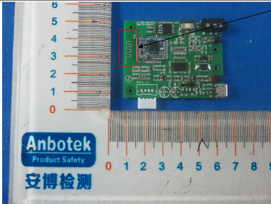
PCB of the EUT-Front View