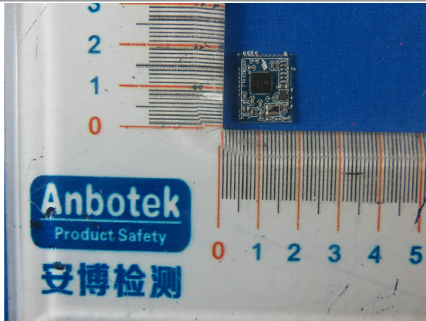
PCB of the EUT-Front View