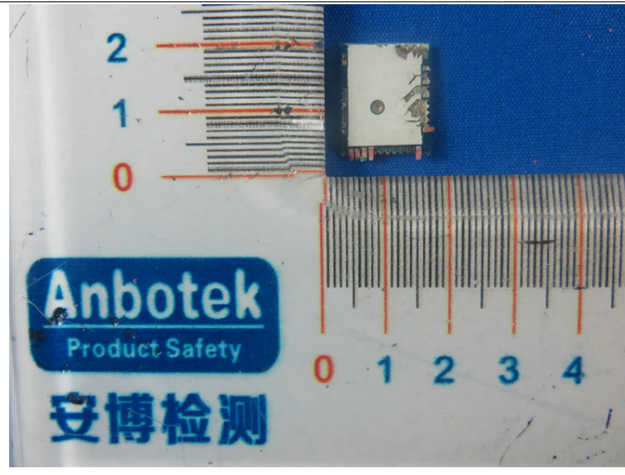
PCB of the EUT-Back View