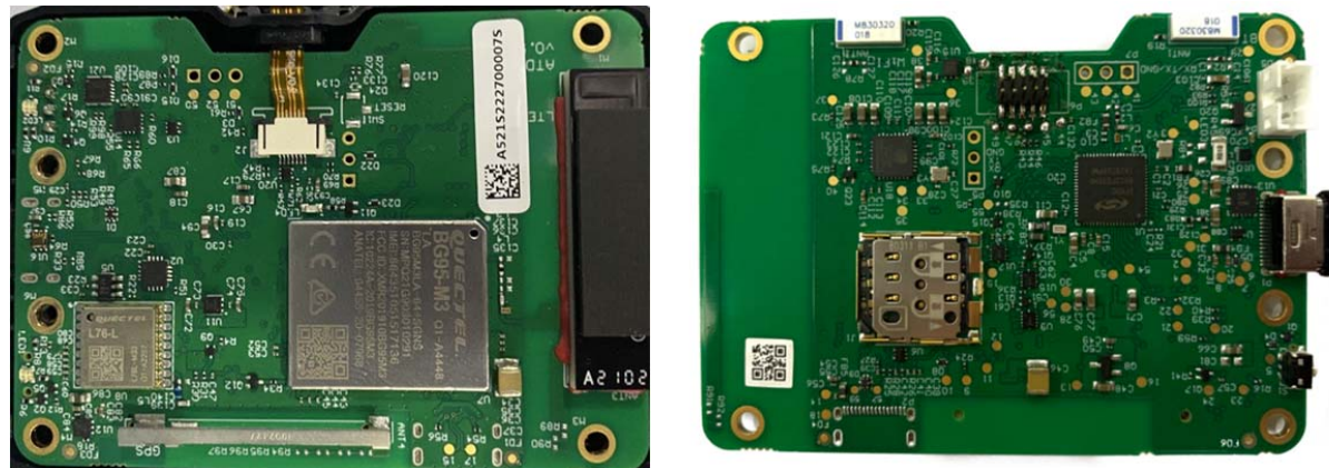
Figure 5.1 PCBA board