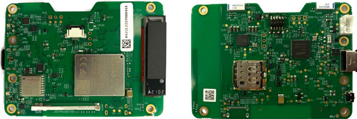
Figure 5.1 PCBA board