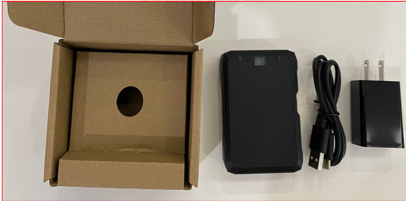
Figure 2.2 Device