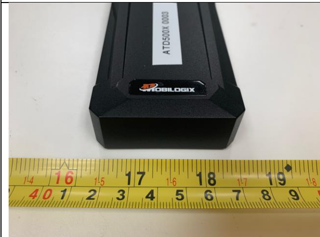
EUT Front View