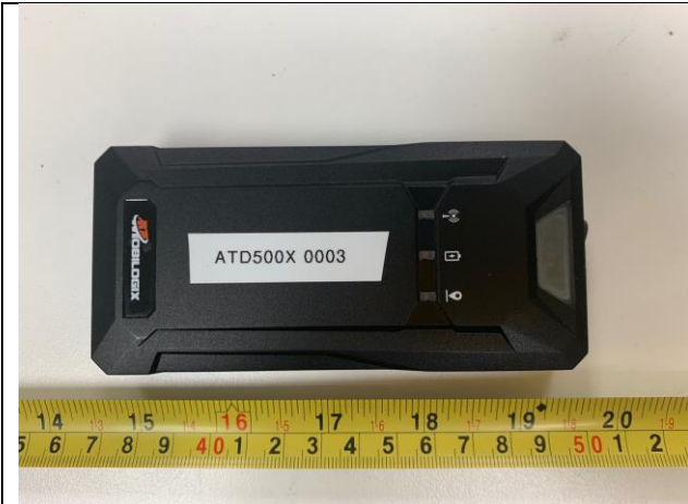
EUT Top View