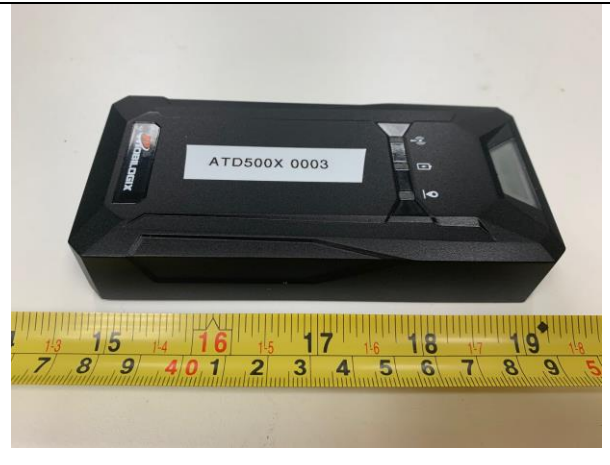
EUT Right View