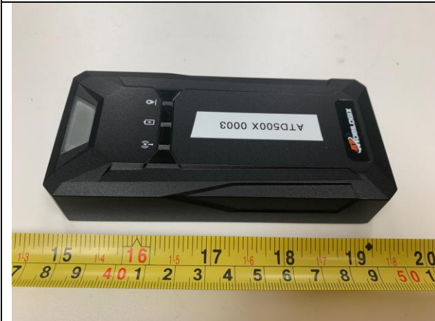
EUT Left View