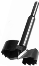
Ø 80 mm drill bit